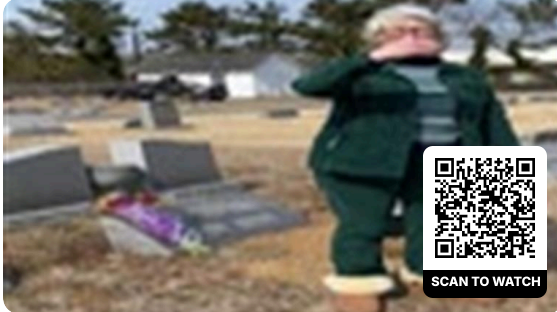
Burial Service 2