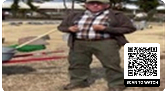
Burial Service 5