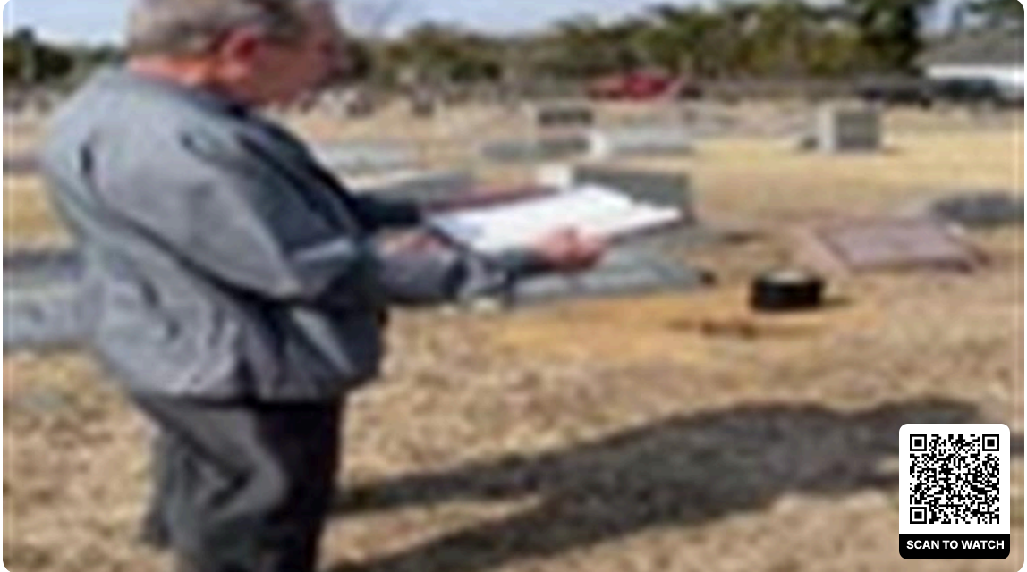
Burial Service 1