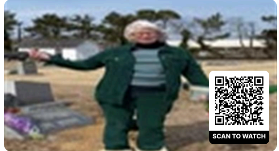
Burial Service 3